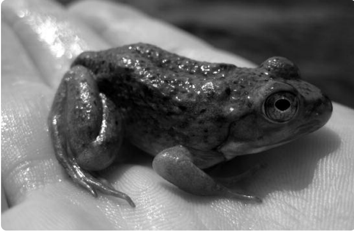
This tiny frog is most likely a very young bullfrog, noted for its deep and insistent call for “more rum.”