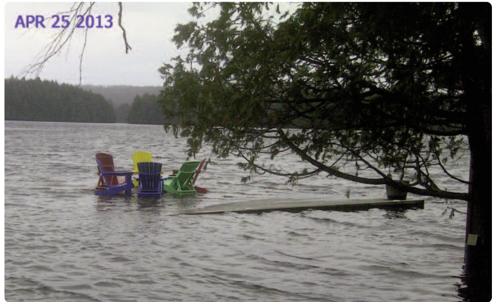
Water levels in April 2016 (top) were only slightly lower than in April 2013 (bottom).