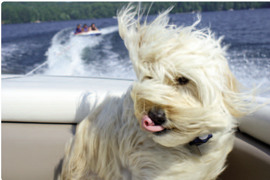
Carrie Harris wins the Life at the Lake category with this fantastic picture titled 'Dog Days of Summer.' Taken at her sister's cottage on Rabbit Bay, she says the dog Java loves the boat ride as much as the kids love tubing behind it. Nothing says summer better than boating, blue sky and the wind in your hair...

Congratulations to the winners of our 2012 Photo Contest: