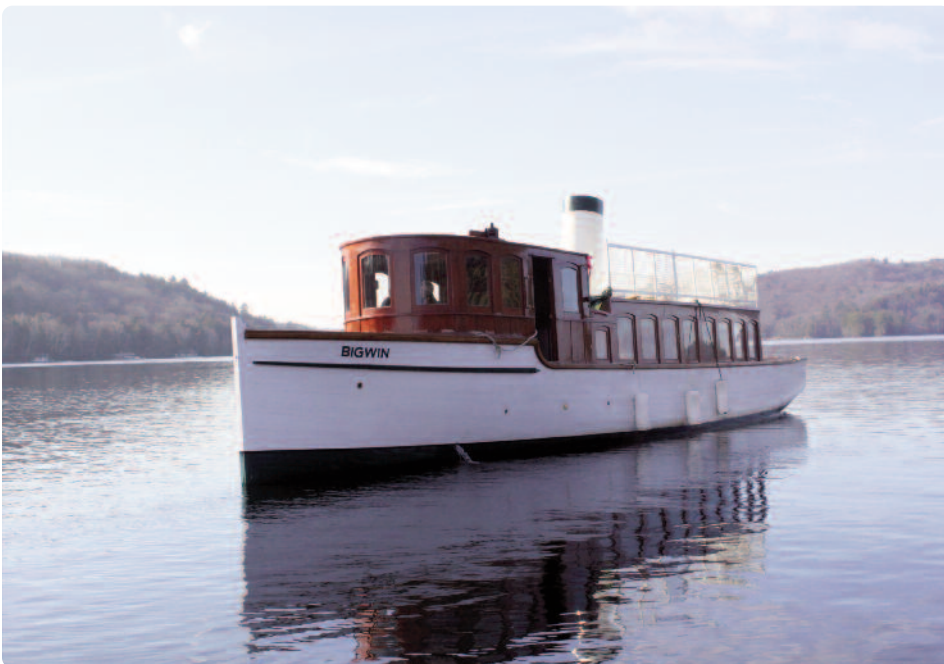
The SS Bigwin on the water last November to test drive her new electric engine.

SAFE BOATING COURSES with PCOC TEST at Pride of Lake of Bays Marine